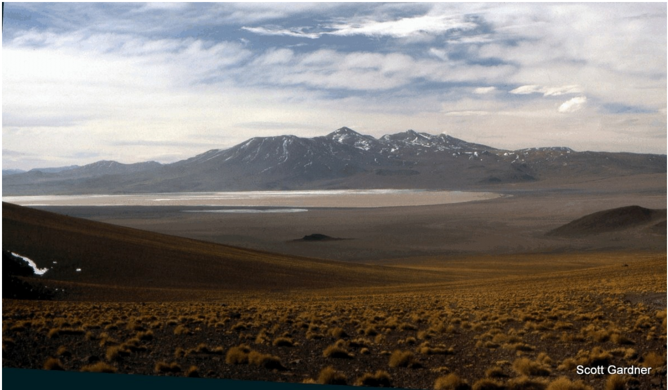
Fig 2. Laguna Colorada, September, 1986.