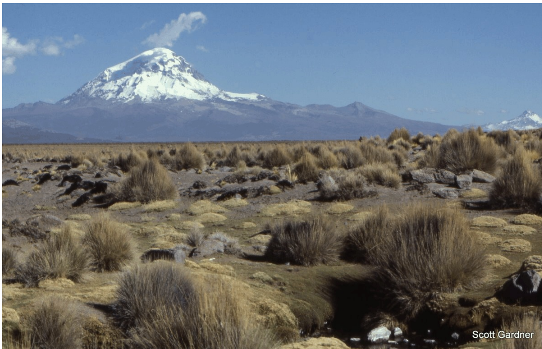
Fig 3. Nevada Sajama, Oruro, Bolivia, 1986.